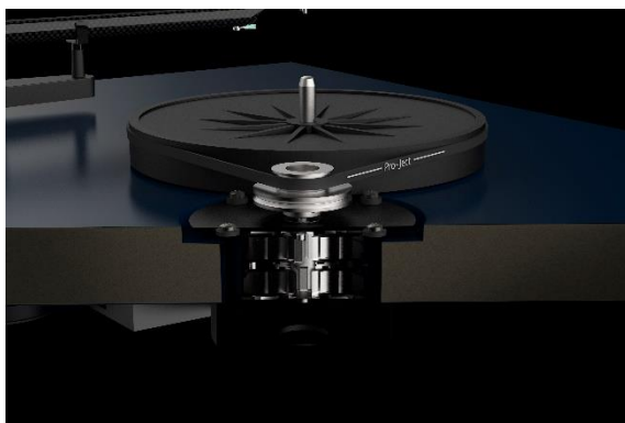
AC drive motor with isolation plate

At the centre of the Debut Carbon EVO's design is its 8.6" one-piece carbon fibre tonearm. Chosen for its optimal acoustic properties, carbon fibre is rarely found on turntables below £500, allowing the Debut Carbon EVO to stand apart from the competition as a special proposition. In combination with the pre-mounted Ortofon 2M Red moving magnet cartridge, special sapphire bearings, high-purity copper internal tonearm wiring and shielded termination box, the tonearm system delivers a true high-end sound quality with a detailed sound presentation that conveys every musical emotion.