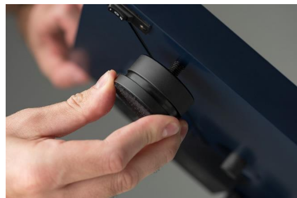
Height-adjustable aluminium feet with TPE damping

Structurally, the Debut Carbon EVO is most recognised by its expertly finished main chassis, available in nine elegant finish options (various eight-layer hand-painted options or a walnut veneer). The traditional rectangular footprint has a timeless minimalism, and is made of MDF for its excellent anti-resonant properties, and this tendency to minimal vibrations continues throughout the Debut design.