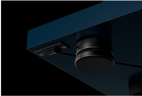
Three-position power switch for speed settings

sits on three height-adjustable aluminium feet with TPE-damping to guarantee a stable platform with good isolation from the surface it is placed upon.