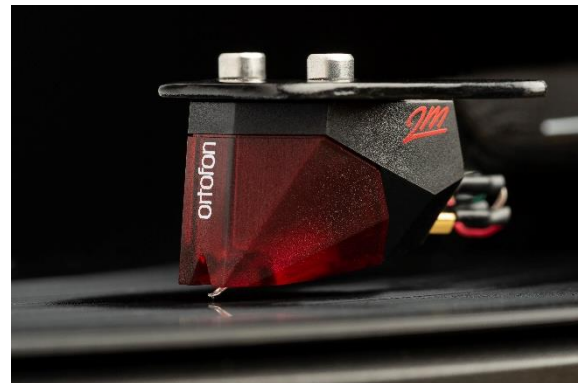
Ortofon 2M Red cartridge pre-installed

At the centre of the Debut Carbon EVO's design is its 8.6" one-piece carbon fibre tonearm. Chosen for its optimal acoustic properties, carbon fibre is rarely found on turntables below £500, allowing the Debut Carbon EVO to stand apart from the competition as a special proposition. In combination with the pre-mounted Ortofon 2M Red moving magnet cartridge, special sapphire bearings, high-purity copper internal tonearm wiring and shielded termination box, the tonearm system delivers a true high-end sound quality with a detailed sound presentation that conveys every musical emotion.