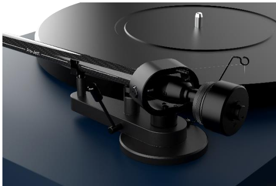
One-piece carbon fibre tonearm with sapphire bearings

Taking its name from the multi-award winning Debut Carbon turntable, the Debut Carbon EVO expands on its predecessor's features, finishes and technical abilities thanks to newly developed engineering capabilities.