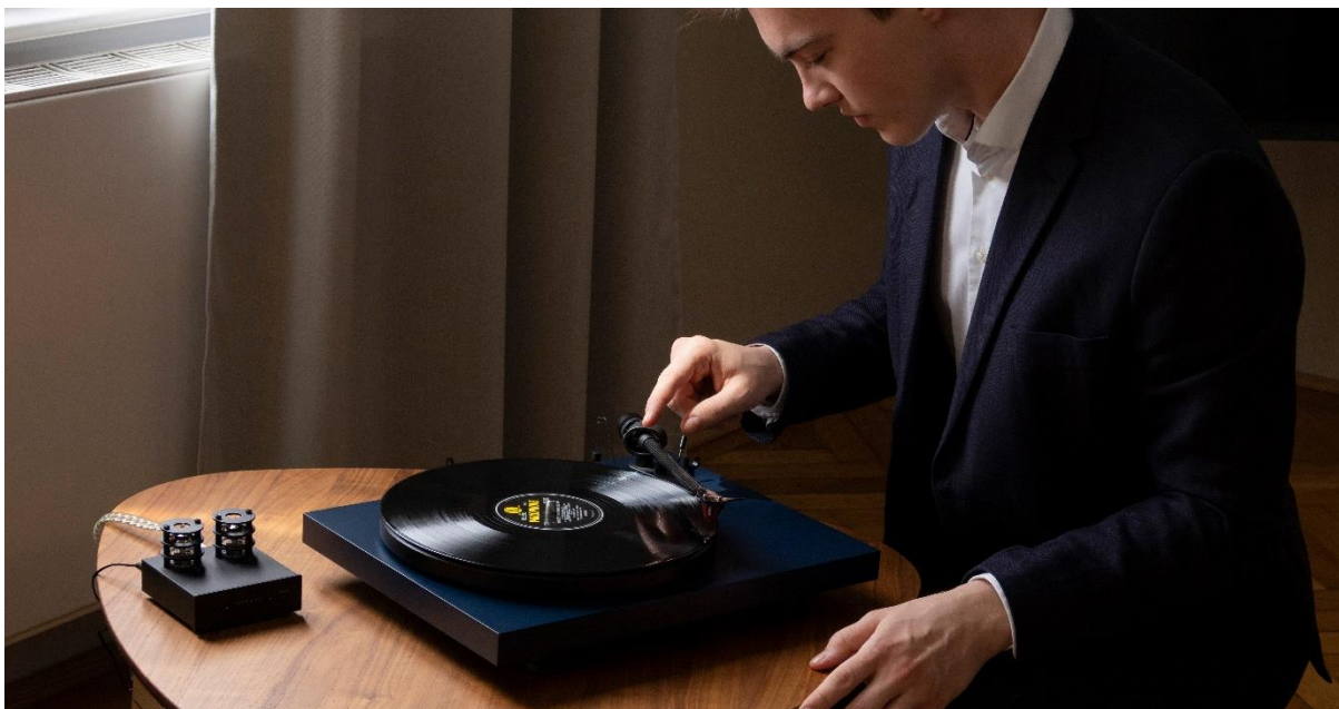
Debut Carbon EVO

But with Debut Carbon, Pro-Ject and the Debut name also went truly global. Where the first Debut caused an analogue wave in Europe, the Debut Carbon exploded into the US market, where the vinyl boom of the mid-2010s was really born. Since that time, analogue has once again appeared at the centre of the hi-fi market as an essential source for any serious hi-fi system, and Debut is a key part of that story.