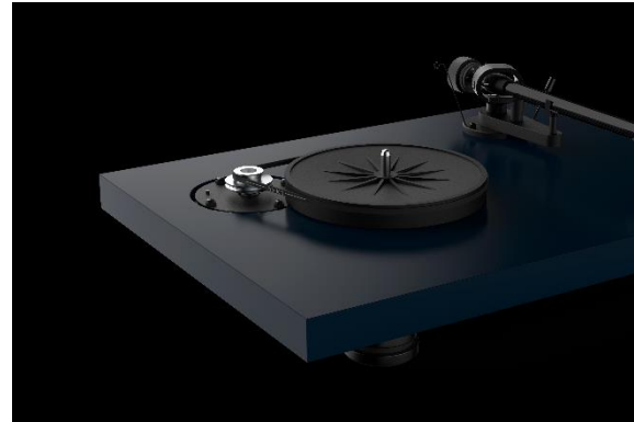
Premium sub-platter drive system

Out of the box, the Debut Carbon EVO is capable of playing 33, 45 and 78 RPM records. The new speed control solution is implemented in a highly intuitive fashion using a three-position rocker switch (33 – OFF – 45). For precise speed at 78 RPM, a separate drive-belt is also supplied. As well as bringing convenience to the overall design, the speed control system also ensures the motor rotation is electronically regulated for total accuracy and stability.