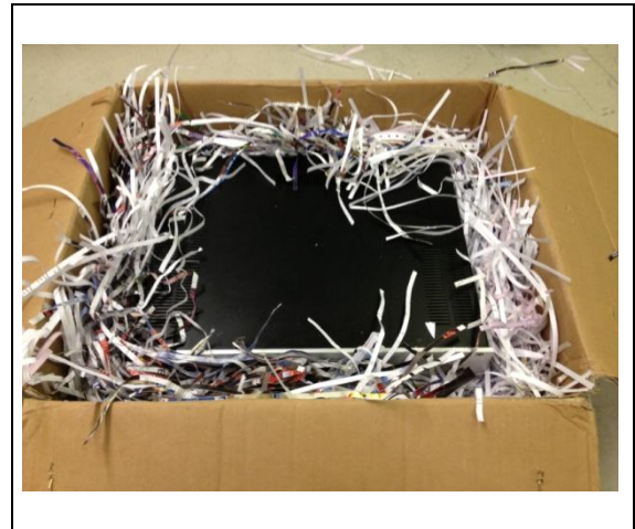
There is no padding on top of the product to prevent damage during transportation.