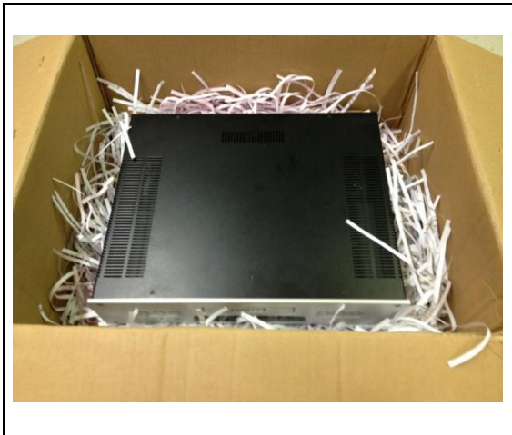
This product is not packed tightly enough and it is at risk of damage.