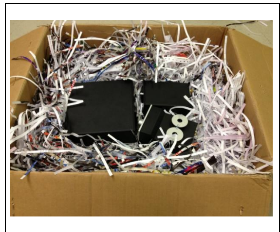
Different components are touching each other. This might cause scratches and further damage.