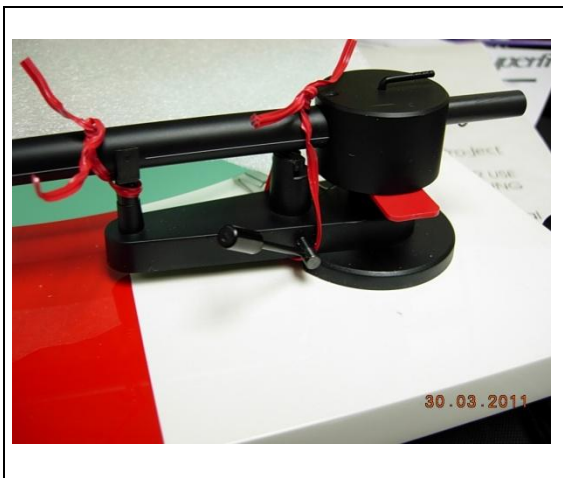
This unipivot tonearm has been secured properly, in three places. Non-unipivot tonearms should be tied to their support.